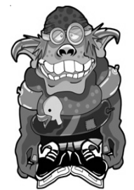
"Splash" CARI Aquatics Mascot

Be Sure To Check Out Our Summer Program Brochure! Leadership Programs Swimming Lessons Private Lessons Aqua Fit Programs Program Information: aquatics@caripei.ca Website: http://www.caripei.ca Phone: 902-569-4584